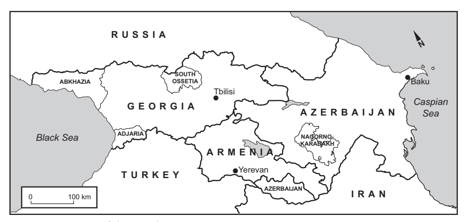
Figure 5.2. Map of the South Caucasus

2.5 per cent; Georgia in particular had a very high level of military spending in comparison to the size of its economy. Since these figures do not include spending by non-state actors, they underestimate the economic burden that military spending constitutes for these countries. These figures also underrepresent the military build-up in the South Caucasus, since they do not take account of the vast amounts of military aid that have flowed into the region over recent years.<sup>28</sup>